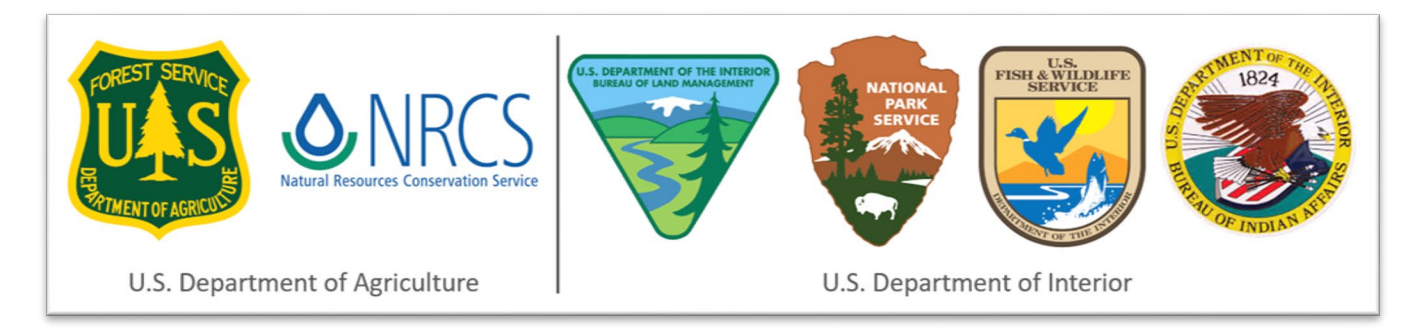
Figure 2. Depending on the location of a fire, a federal BAER team may be comprised of specialists from any of the following agencies within the U.S. Department of Agriculture or Department of Interior.

Information collected by federal BAER teams is shared with other federal, state, and local emergency response agencies so that they can provide assistance to communities and private landowners who may also be affected by potential post-fire damage. Federal BAER teams are typically comprised of specialists from one or more federal agencies, working on federal-owned land (Figure 2). NRCS provides assistance on privately-owned land. In cases where the fire perimeter covers mostly state-owned land, tribal land, and/or private property, federal agencies may not take the lead and there may be a need for the RRG to assess creating their own BAER team – see example here for how this has been done. Note that some federal agencies (particularly BLM) may use the Wyden Amendment to allow for use of federal funding on private property as long as federal land or property will benefit from the strategies implemented. Further details on the assessment process and various lead and support agencies are provided in Appendix A – Post-Fire Assessments and Project Implementation.