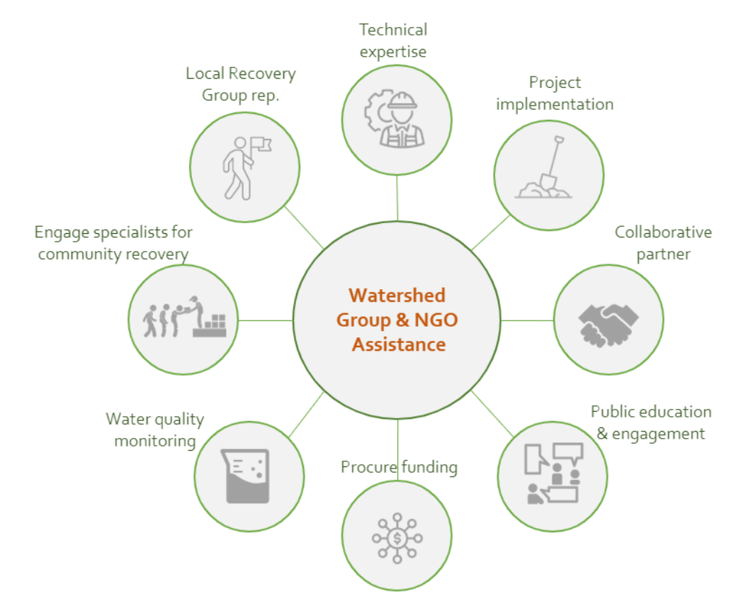
Figure 6. Areas in which watershed groups and NGOs may be able to assist in rehabilitation efforts post-fire.